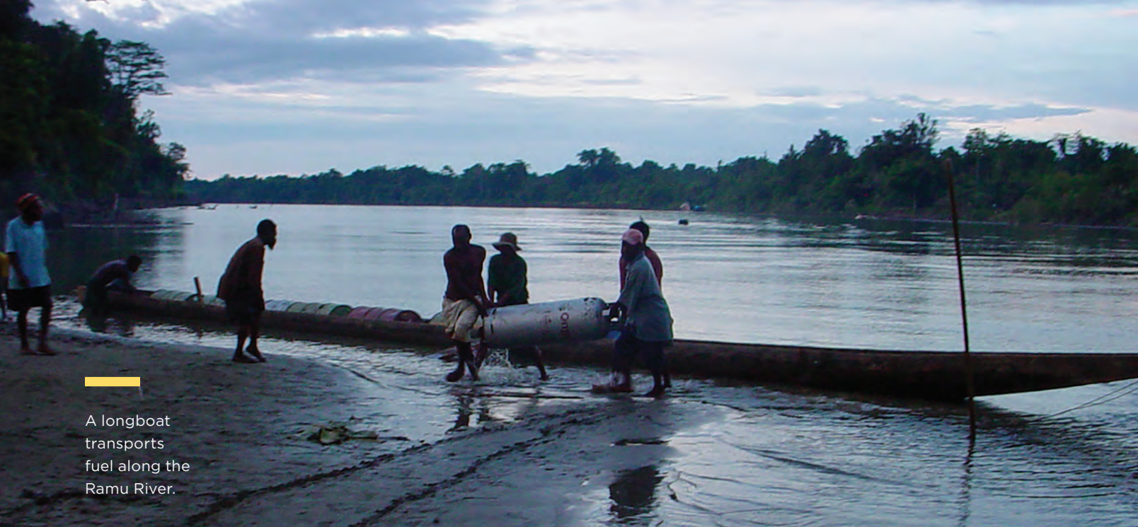
A longboat transports fuel along the Ramu River.